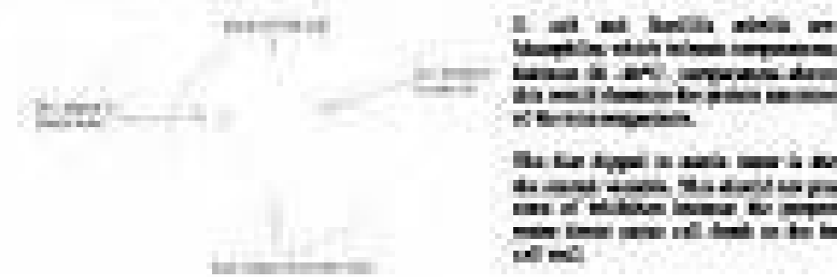
Fig. 1 The antilucer activity of Normacid syrup (NS) in mice. The ulcer index and ulcer score were significantly lower in the MO+Ethanol and CIM+Ethanol groups compared to the Ethanol and MO only groups.

The antilucer activity was assessed by measuring the ulcer index, free acidity, total acidity and pH of gastric fluid. The ulcer index was assessed by measuring the ulcer score and ulcer index. The ulcer score was assessed by measuring the ulcer area and ulcer index. The ulcer index was assessed by measuring the ulcer area and ulcer index.